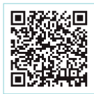
Supplementary Guide webpage

Please look at the "Garbage Collection Calendar" to help you figure out how to sort recyclable and non-recyclable garbage. Use the Supplementary Guide together with the calendar to check information in a foreign language. The Supplementary Guide has been prepared in nine languages, including English, Chinese and Vietnamese.